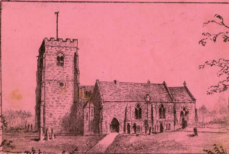
Quorn Church from the Wedding Path.