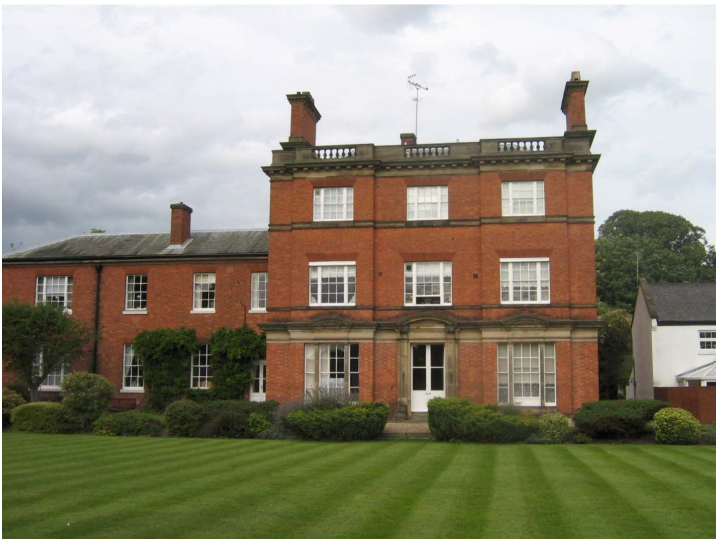
The rear of Quorn Court - August 2009