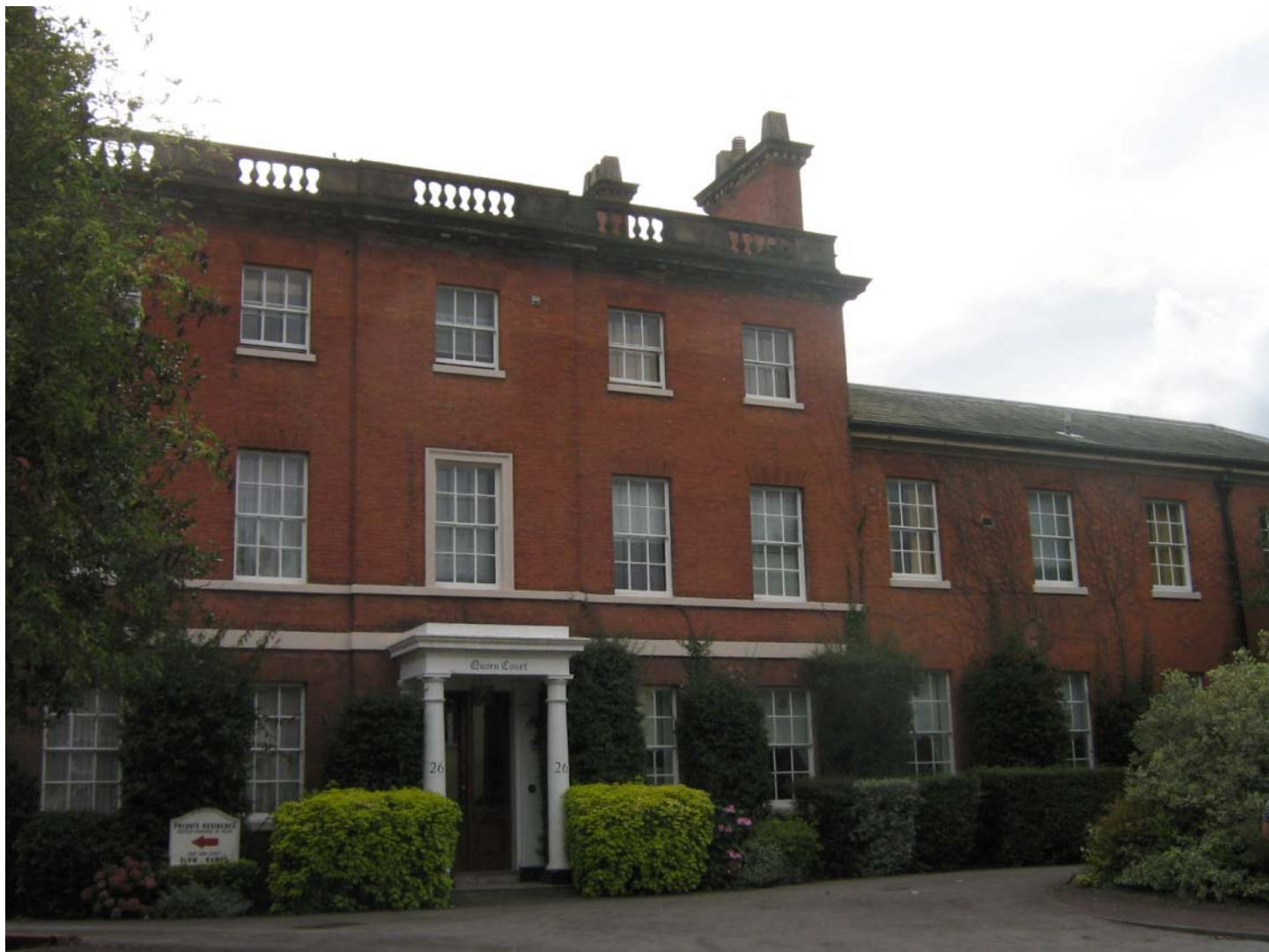
The front of Quorn Court - August 2009