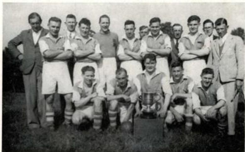
THE WINNING 1940 SENIOR CUP TEAM