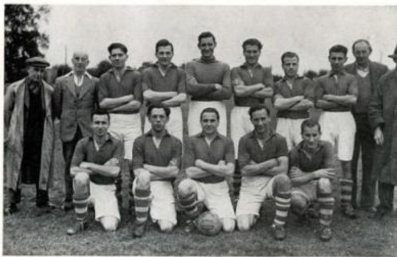
SENIOR LEAGUE DIVISION 2 CHAMPIONS